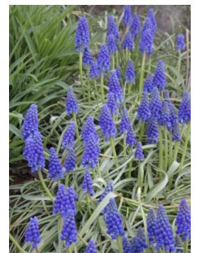
Signs of spring at Evergreen!