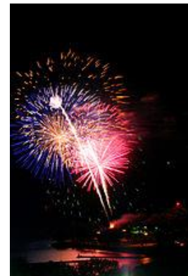
Victoria Day fireworks. Toronto. 2010.

Antepenultimate: (adjective) - third from last